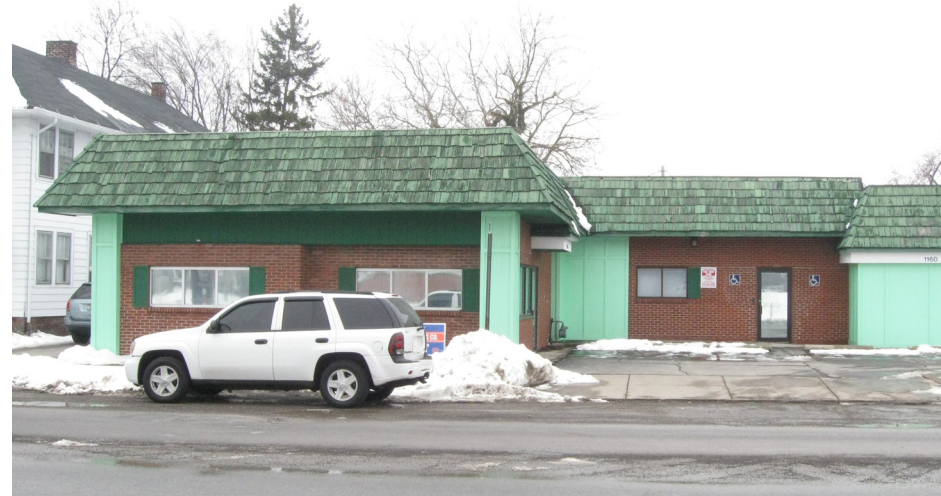
The clinic located at 1160 W. Sylvania Ave.

sensitivity of those already protesting at 22nd St., our desire to be effective, and the encouraging account given by Carol, we felt convicted to practice due diligence. The West Toledo Pathway went down to the abortion clinic on 22nd St. as previously scheduled only to observe the activity of the clinic and take note of those who were silently praying. We were there from about 4 - 6:00 pm. When we arrived, the parking lot was full and in those two hours we saw about fifteen cars come to the